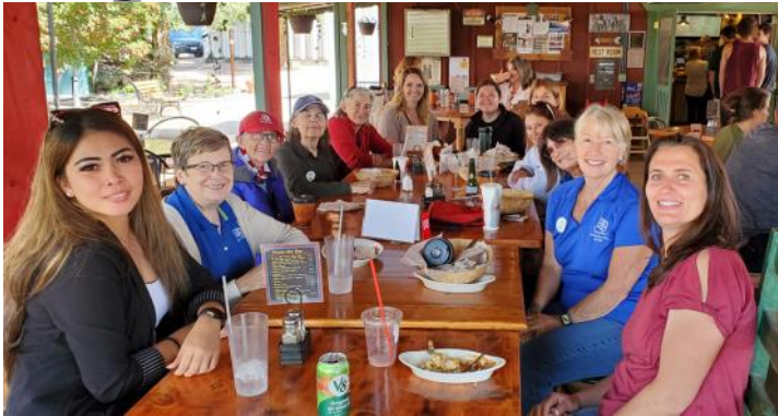
Chapter members and guests had a great breakfast at Coyote's Coffee Den in Penrose, Colorado.