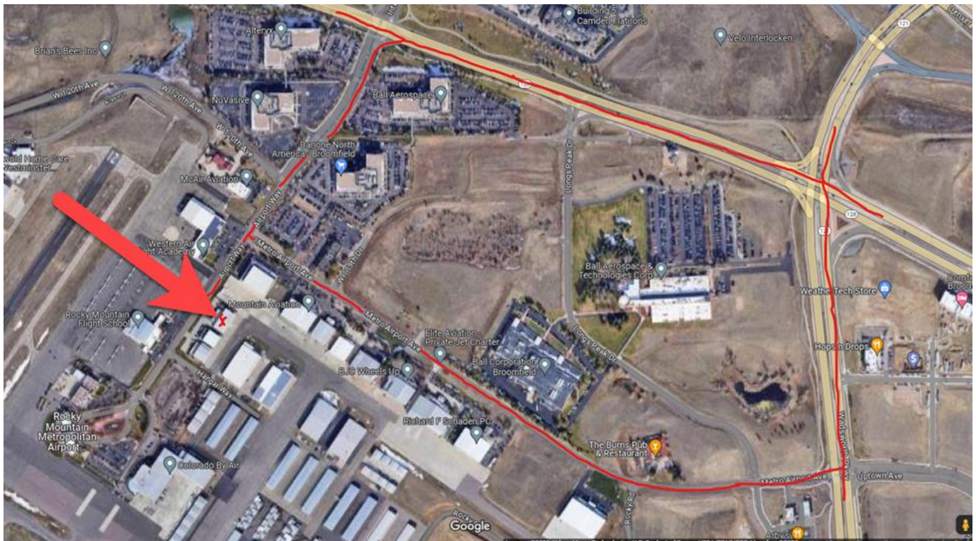
Location is Mountain Aviation, 11900 Airport Way, Broomfield, at Rocky Mountain Metropolitan Airport (KBJC)

Mark your calendars! Be part of the ultimate aviation cross-country challenge.