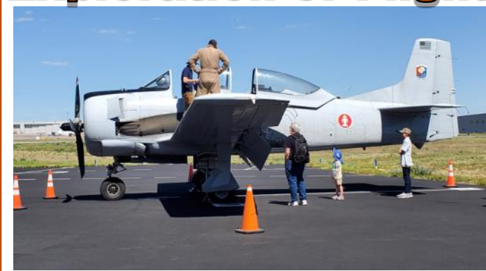
T-28 Trojan at WOTR Exploration of Flight